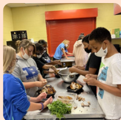
MEALS AND SNACKS