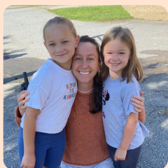
A SAFE ENVIRONMENT