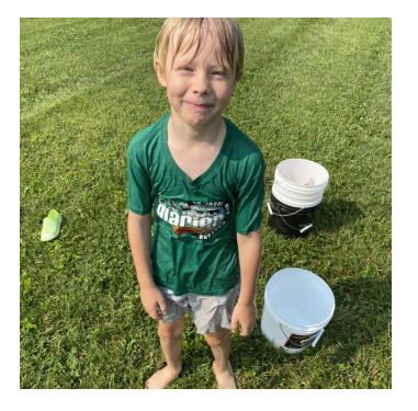
130 participated on a sports team