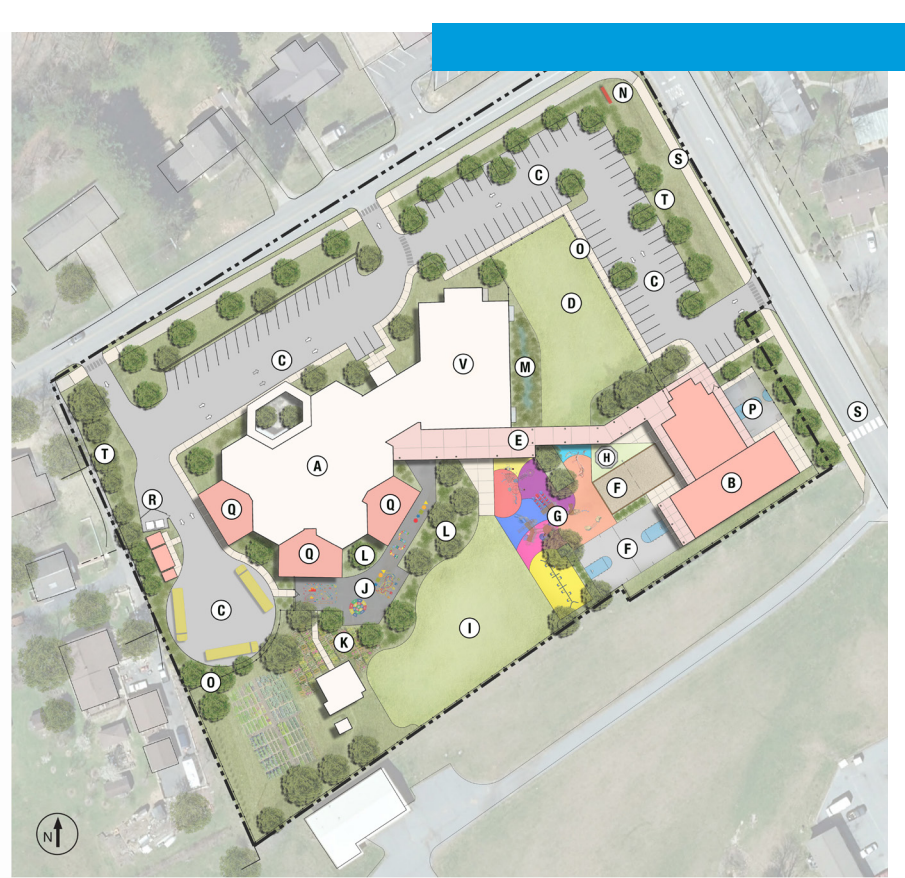
THE CINDY PLATT BOYS & GIRLS CLUB