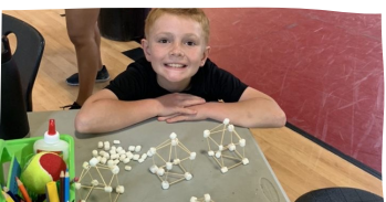
Science can be fun!

Members did intensive hands-on projects that included constructing (and erupting!) paper mache volcanoes, making homemade ice cream in a Ziploc bag, learning why Mentos and diet cola create an explosive reaction, and solving a kitchen mix-up mystery using clues and deductive logic. Members agreed that they looked forward to STEAM more than any other academic program of the summer.